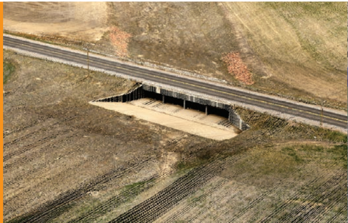
Colorized Point Cloud